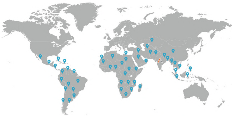
Global Presence More Than 85+ Countries