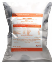
ACID CONCENTRATE PART - A