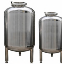
SS STORAGE TANK