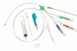
CENTRAL VENOUS CATHETER (CVCC) SET