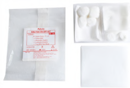
DIALYSIS ON/OFF KIT