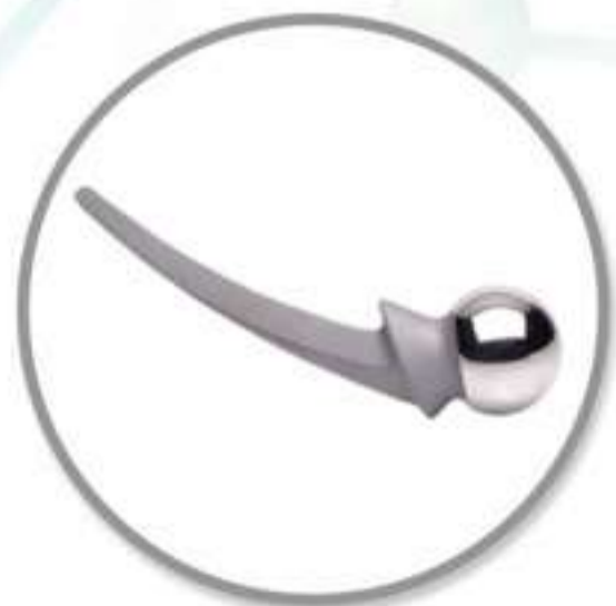
Thompson Hip Prosthesis