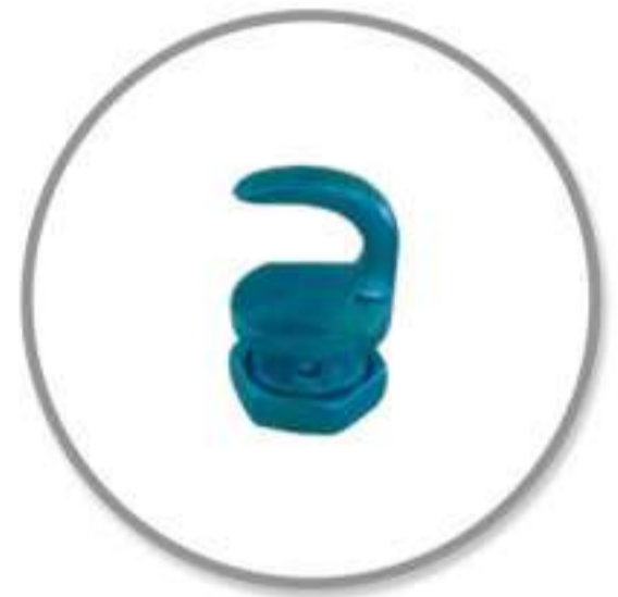
Leminar Hook Wide Blade