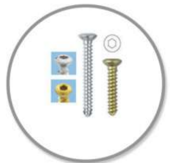
4.5mm Cortex Screw

Thread Diameter : 3.5mm Length : 10mm to 50mm