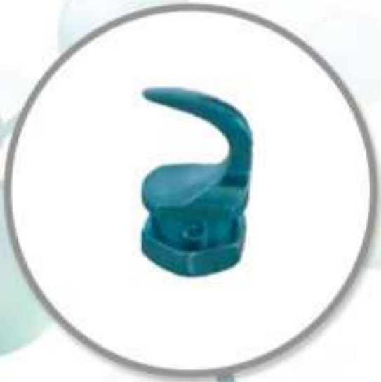
Leminar Hook Angle Blade