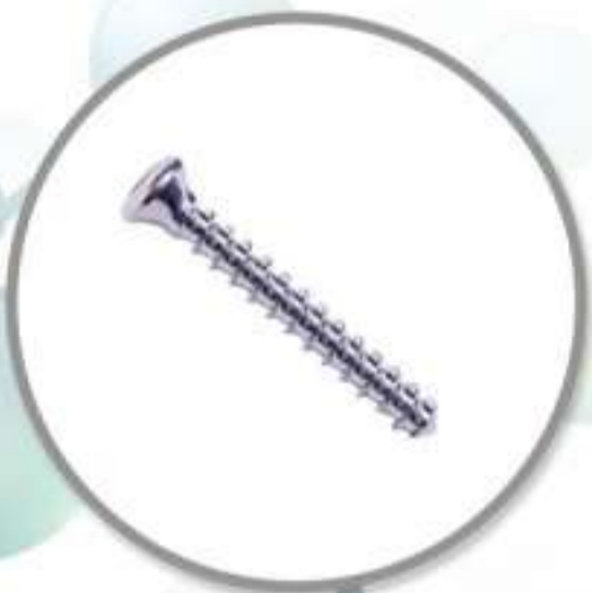
3.5mm Cortex Screw (14 TPI)

Thread Diameter : 3.5mm Length : 10mm to 50mm