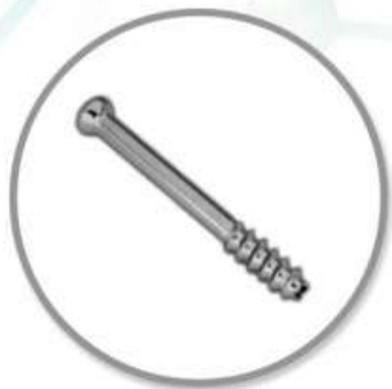
6.5mm Cannulated Cancellous Screw (16mm Threaded)

Thread Diameter : 6.5mm Length : 30mm to 115mm