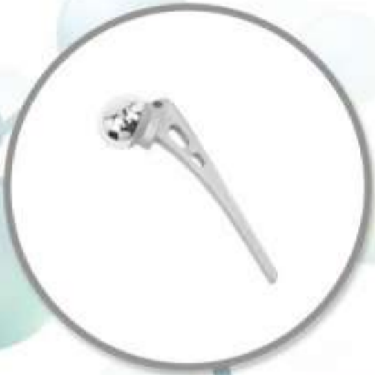
Austin Moore Hip Prosthesis