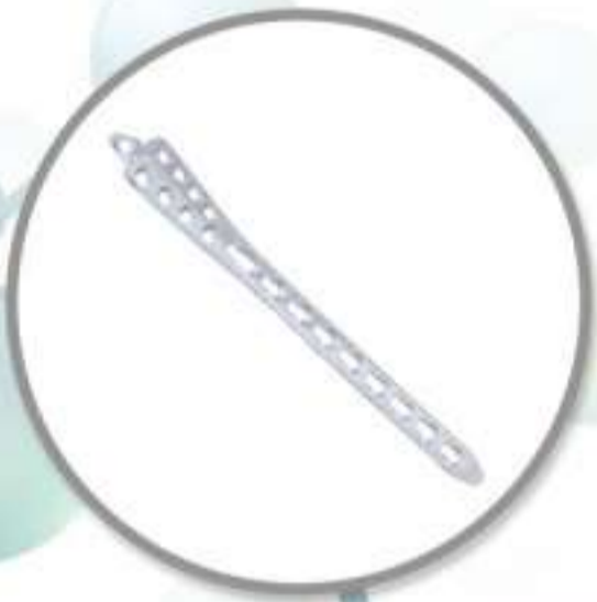
DCS Locking Plates