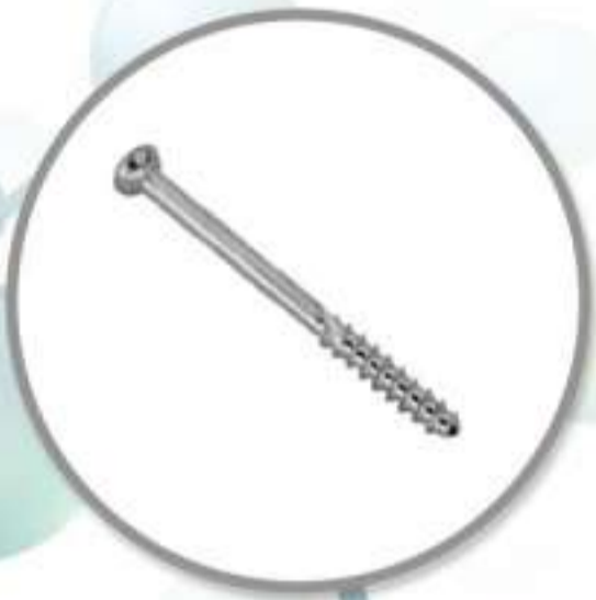
4.0mm Cannulated Cancellous Screw (Short Threaded)

Thread Diameter : 4mm Length : 10mm to 75mm